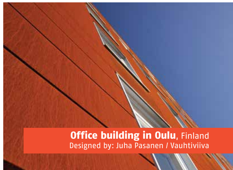
Office building in Oulu, Finland Designed by: Juha Pasanen / Vauhtiviiva

This product range, delivered in form of heavy plates, cut-to-length sheets, strip and coil products, is manufactured based on the US Steel Corporation license and meets the requirements of EN 100255:2004.