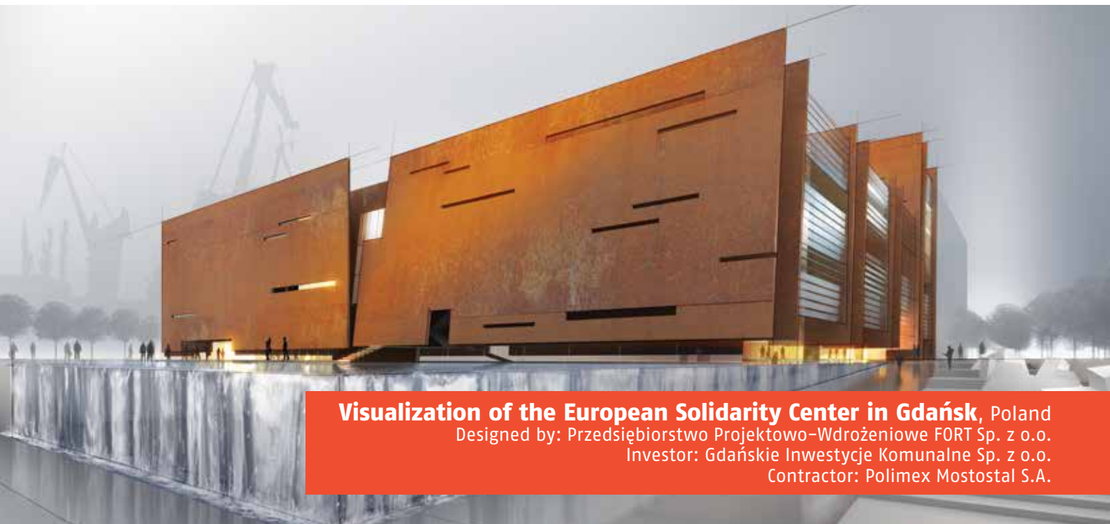
Visualization of the European Solidarity Center in Gdańsk, Poland Designed by: Przedsiębiorstwo Projektowo-Wdrożeniowe FORT Sp. z o.o. Investor: Gdańskie Inwestycje Komunalne Sp. z o.o. Contractor: Polimex Mostostal S.A.

Due to their unique chemical composition, Cor-Ten ® flat sheets are significantly more resistant to atmospheric corrosion than similar elements made of standard carbon steel.